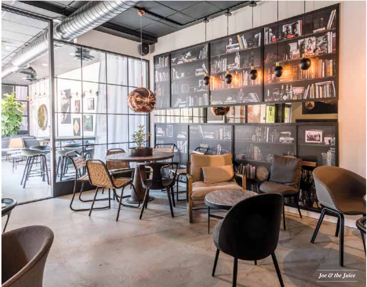
Joe & the Juice

APRIL 2018 // A GUIDE TO WHAT'S HAPPENING NOW IN YOUR AREA